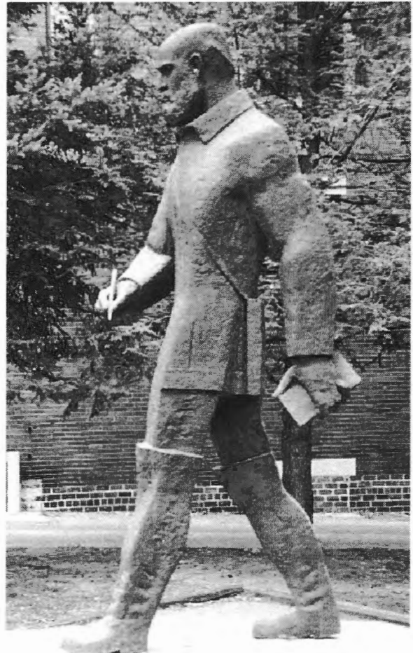
MacGahan statue in New Lexington

It was estimated that between 12,000 and 15,000 people were in attendance at the services in New Lexington that day. One of Ohio's heroes had been returned to his native soil. Further ceremonies, tributes, and monuments would