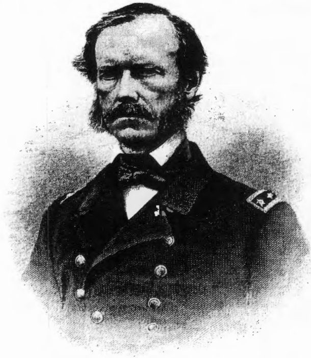
Admiral John A. Dahlgren (1809-1870)

The remainder of the summer of 1865 they spent on the Hudson, at Newburgh and West Point. In early November, 1865 obsequies were held in