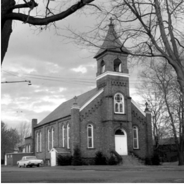
St. Stephen Church on Water Street