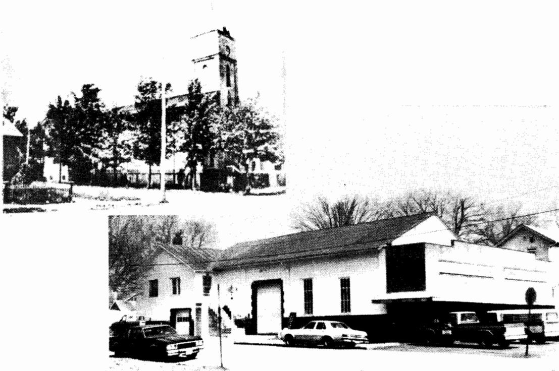
WAVERLY IMMACULATE CONCEPTION CHURCH

The building pictured above is what now remains of the Church of the Immaculate Conception in Waverly, Pike County, Ohio. The church was built in 1865 but was never completely paid for; it was lost in the year 1873 and was converted into an opera house. Some time later the roof was raised on jacks, the upper eight feet of the walls were removed, and it was used as a garage. It now serves as the Armbruster & Armbruster plumbing store, with the new front added in recent years where the church's tower and steeple once stood. The building is at the corner of East and Market streets. Armbruster & Armbruster made available the inset, which depicts the building when it was still a church.