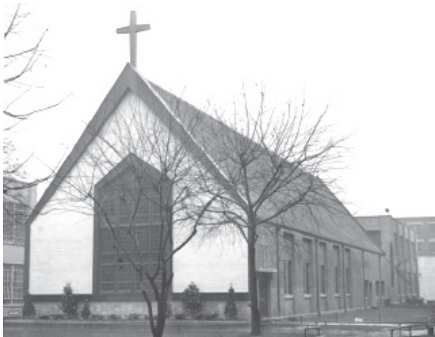
The 1955 St. Catherine of Siena Chapel

began to throw items at the police officers. The officers opened fire on the cellblocks, killing one prisoner and wounding four others. After this, the rioters quickly surrendered and peace was again restored to the prison.